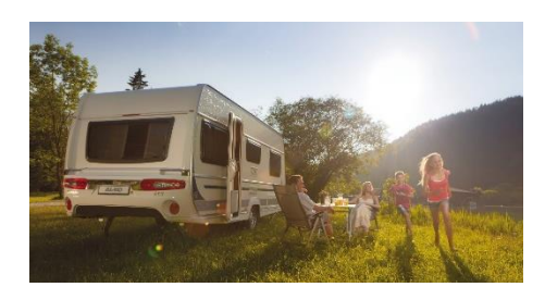
Caption 2: Owners of recreation vehicles don't let corona spoil their passion for travelling in leisure vehicles or caravans. Particularly caravanning provides a comprehensive autarky more than almost any other kind of tourism.