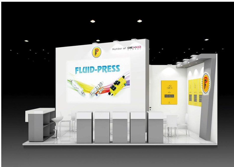
Caption 1: At BAUMA 2022, AL-KO Vehicle Technology, SAFIM and Fluid-Press will present themselves as one corporate family for the very first time.