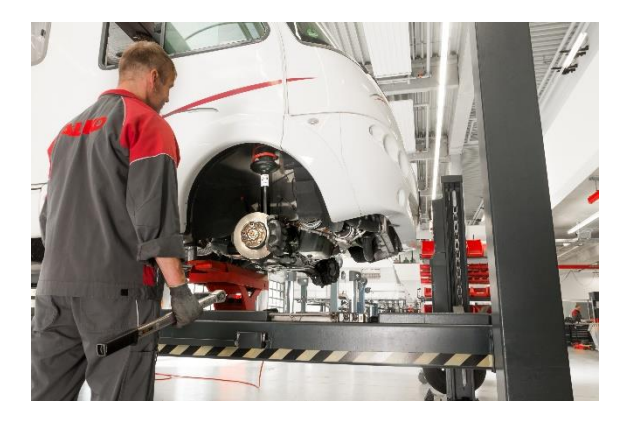
Caption 2: More than 3,800 employees work for the AL-KO Vehicle Technology Group at over forty sites worldwide.